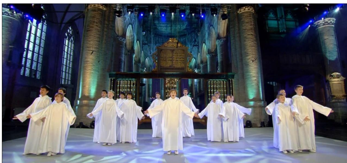
(上图: Libera 在尼德兰圣皮耶特教堂现场演唱会录像)

Libera 的音色美丽神圣，他们的乐迷超越种族、年龄，遍布全世界。在 EMI Classics 先后发行《Free》、《visions》、《angel voices》、《new dawn》、《peace》等专辑，Libera 的美声被公认「充满治愈人心的力量」、「连接至光明的希望」。